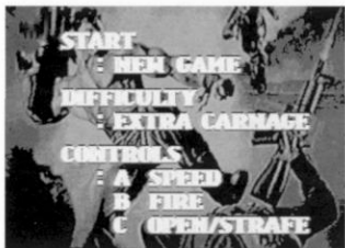
Fig.2 Menu Screen